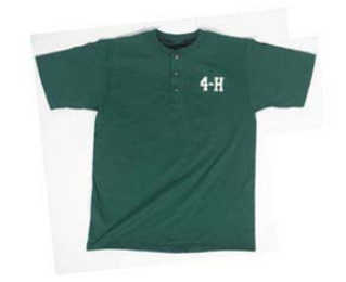
Wear a 4-H T-Shirt Each Day

During the 2008 Martin County Fair, Martin County 4-H youth will be required to wear a 4-H shirt at all times, while you are at the fair. The only exception will be during show time and sale time. A club t-shirt is quite acceptable, however, at the first barn day (Saturday, February 2ed) 4-H shirts will be available through your clubs and also through the 4-H office at $5 each.