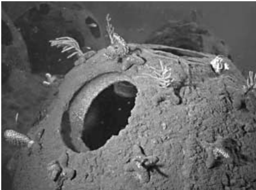
8 MONTHS AFTER SEEDING