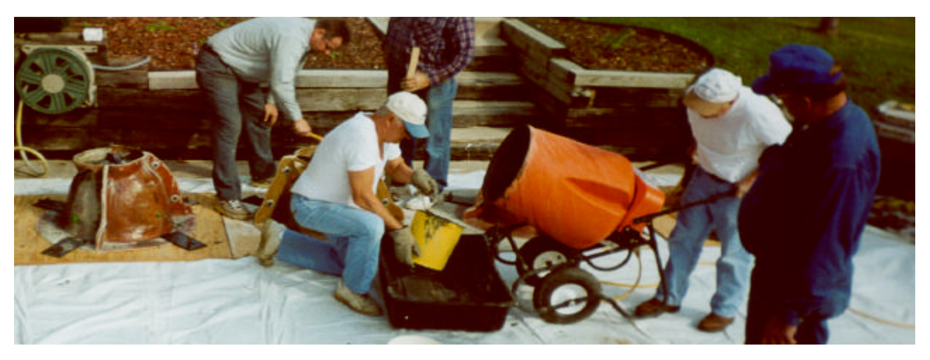
Oliver Beach Community Association Making Reef Balls