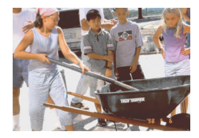
First Reef Ball Being Poured for Reef Placement in May 2003