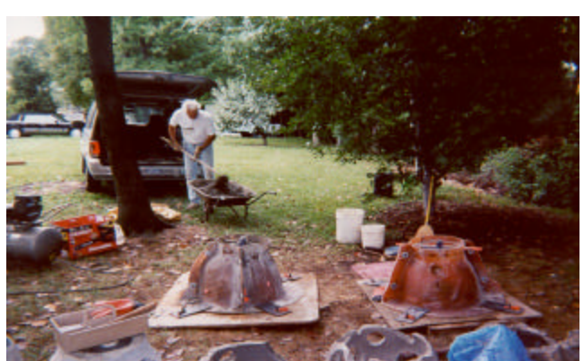
Reef Ball Mold System at Work in Bob's Backyard